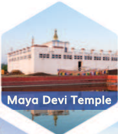
Maya Devi Temple