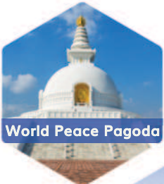
World Peace Pagoda